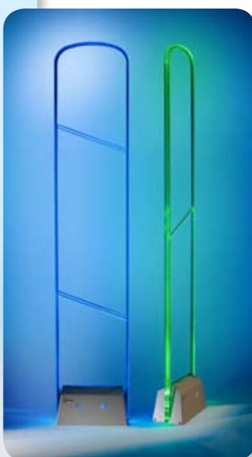
Designergate Slim Prisma